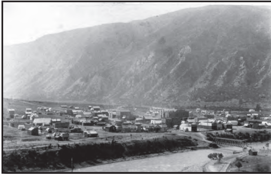
Glenwood Springs in 1886

Glenwood Sps. Historical Society Museum located at 10 th & Colorado Call us at (970) 945-4448 or email us at history@rof.net